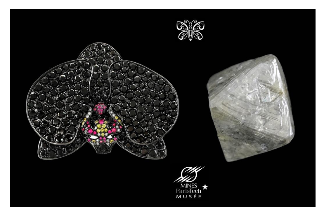
Back diamonds in "Magie Noire" by Paula Crevoshay, and a natural white octahedral diamond in the collection of the Mineralogy Museum.

Diamond is more than just a pretty gemstone. For geologists, it tells the story of the deep Earth: it forms at least at 90 miles deep, in the rock making the Earth's mantle, known as peridotite (and in the less common eclogite). Most diamonds are formed from 1 to 3.5 billion years ago, so diamonds also gives clues about the evolution of the Earth's mantle through time. Reaching the surface of the Earth is not an easy task for a diamond: by regular exhumation processes, it is transformed into graphite (C, crystallizing into the hexagonal system). To avoid that transformation, diamond has to travel fast. It happens thanks to a very special kind of volcanism, first found in Kimberley, South Africa: the kimberlitic volcanism. The kimberlitic magma has a very peculiar chemical composition, rich in alkaline and volatiles. This magma travels at fast rates to the surface, bringing back pieces of the Earth's mantle, sometimes including diamonds that are kept intact. Diamond-bearing kimberlitic magmas are found in the oldest parts of continents, called cratons, such as in South Africa, Brazil, Russia, or Canada. In Argyle, Australia, diamonds are found in another rare diamond-bearing magmatic rock, called lamproite.