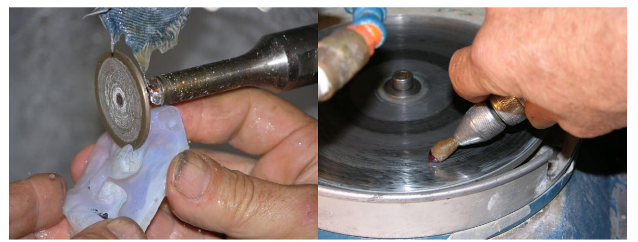
Gem cutter and carver Glenn Lehrer during his work: carving an opal on the left, and faceting a gemstone on the right. Copyright: Glenn Lehrer.

Faceting a gem always begins with studying it first. The gem cutter must identify possible inclusions and fractures, and have to determine the crystallographic orientation of the mineral. From this analysis, the best shape will be chosen to maintain the maximum material while removing most, if not all, inclusions. From the rough to the faceted stone, there may be a weight loss of up to 75%, depending on the quality of the starting gem material! Once the shape is chosen, the lapidary will pre-form the stone, removing the unwanted parts revealed by the preliminary examination. Sawing is usually done using a circular saw incrusted with diamond powder (diamond is the hardest material). The preform shape is generally obtained with a diamond or carborundum wheel and is then polished with an aluminum oxide covered wheel (synthetic corundum). There are several standard shapes for a gemstone, such as the brilliant cut (typical for diamond), the emerald cut (rectangular), pear cut, oval cut, marquise cut, cushion cut, heart cut, princess cut and more. The cut chosen generally depends on the shape of the rough crystal. An elongated cut generally corresponds to a rough mineral crystallizing in elongated prism, such emerald. Much more complex and unique cuts exist, with different shape and extra facets and carving. This art is the specialty of lapidary artists in Idar-Oberstein.