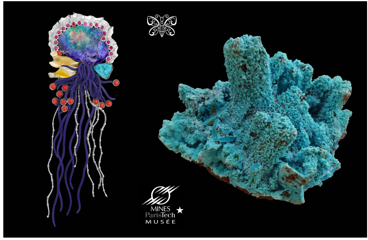
The "Portuguese Man of War" jellyfish by Paula Crevoshay is made with play-of-color opal, chrysocolla, sapphire and coral. On the right, a specimen of chrysocolla from the Democratic Republic of Congo in the collection of the Mineralogy Museum.