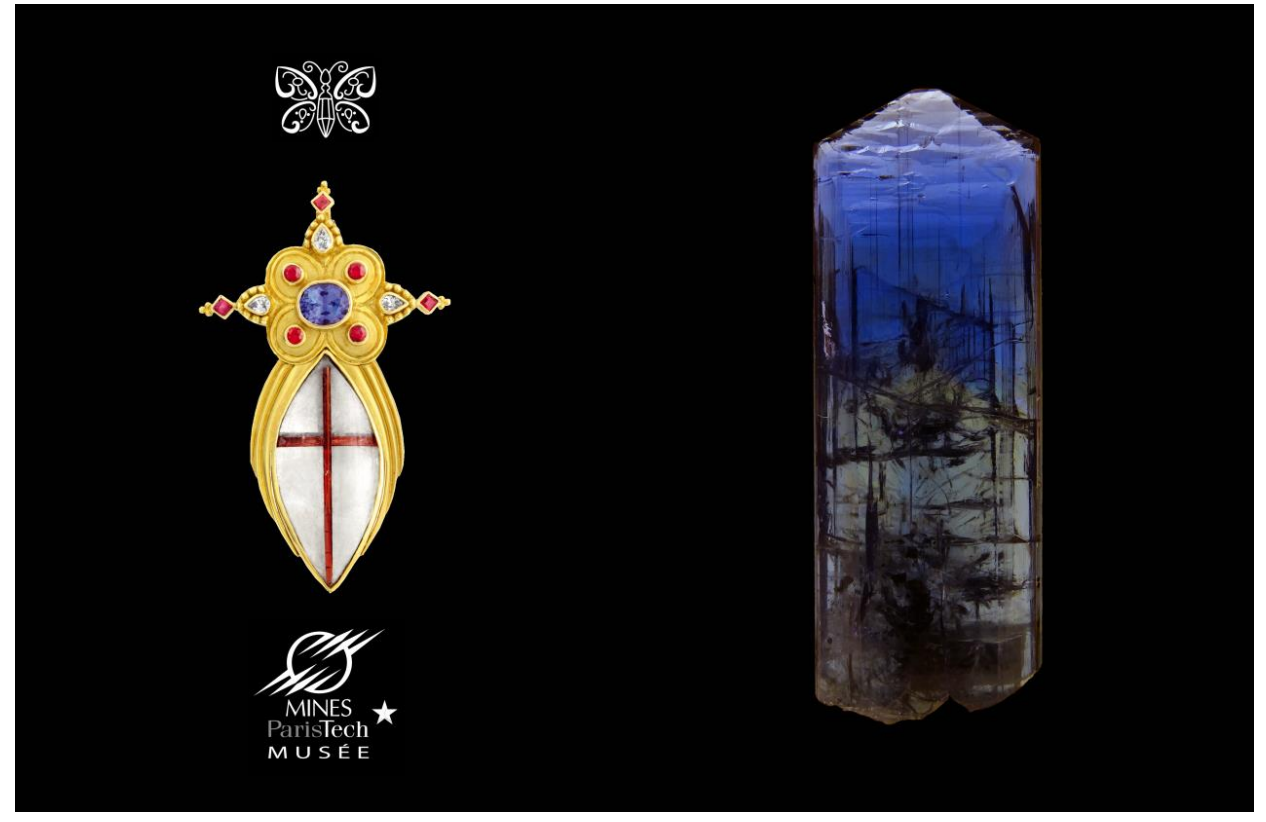
Pendant in rutilated quartz and tanzanite by Paula Crevoshay, and tanzanite rough crystal in the collection of the Mineralogy Museum.

Note that most stones used in the jewelry market have been treated by heating at low temperature (400-500 °C) to increase the intensity of its blue color. In the process, it loses its famous trichroism that one can see on some rough gemmy stones (3 different colors: blue, purple and red / brown, depending on the orientation of the stone).