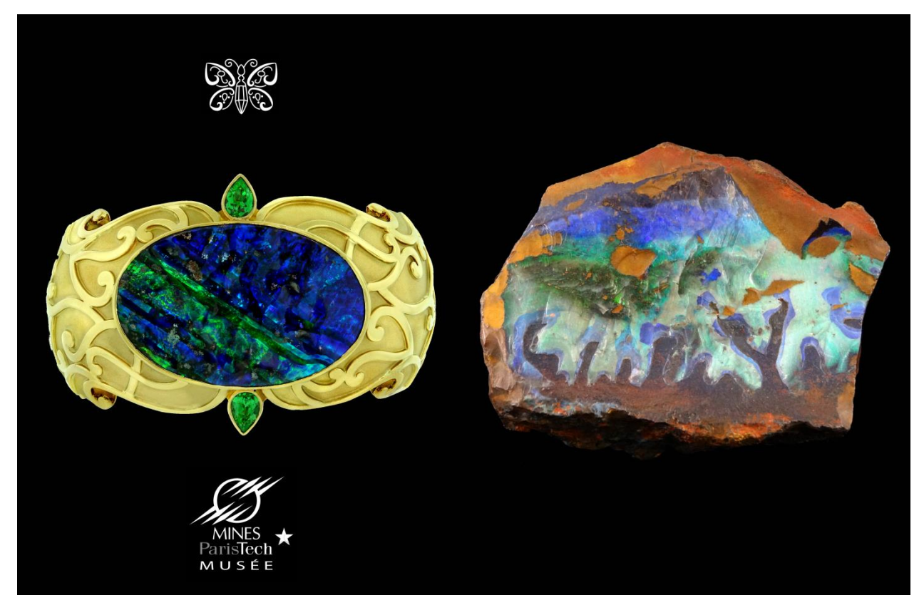
Black opal with play-of-color in the bracelet "Tradewinds" by Paula Crevoshay, and in its rough form coming from Australia, in the collection of the Mineralogy Museum.

When opal does not have this perfect arrangement of spheres, it still can be attractive thanks to its intrinsic color, like for example red opal, commonly referred as "fire opal", such as the specimen shown in the exhibit and that comes from the typical deposit for fire opal: Mexico.