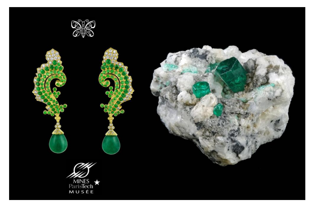
Earrings « Versatile » by Paula Crevoshay with emerald pendants and small tsavorite garnet, and a rough emerald specimen on matrix from Muzo, Colombia, in the collection of the Mineralogy Museum.

The formation of emerald requires very specific geological conditions, and generally differs from one deposit to another. In Colombia, emerald is found in sedimentary rocks. Beryllium and chromium (Cr – the element that gives the green color) were trapped in the sediment basin of the Eastern Cordillera, which is made of black shales rich in carbonaceous materials. It is through a process of alteration and redeposition in fractures or geodes of calcified schists that the emerald crystallizes. The specimen presented in this exhibition demonstrates the association of calcite and emerald, with, at the back of the specimen, shows the black shale.