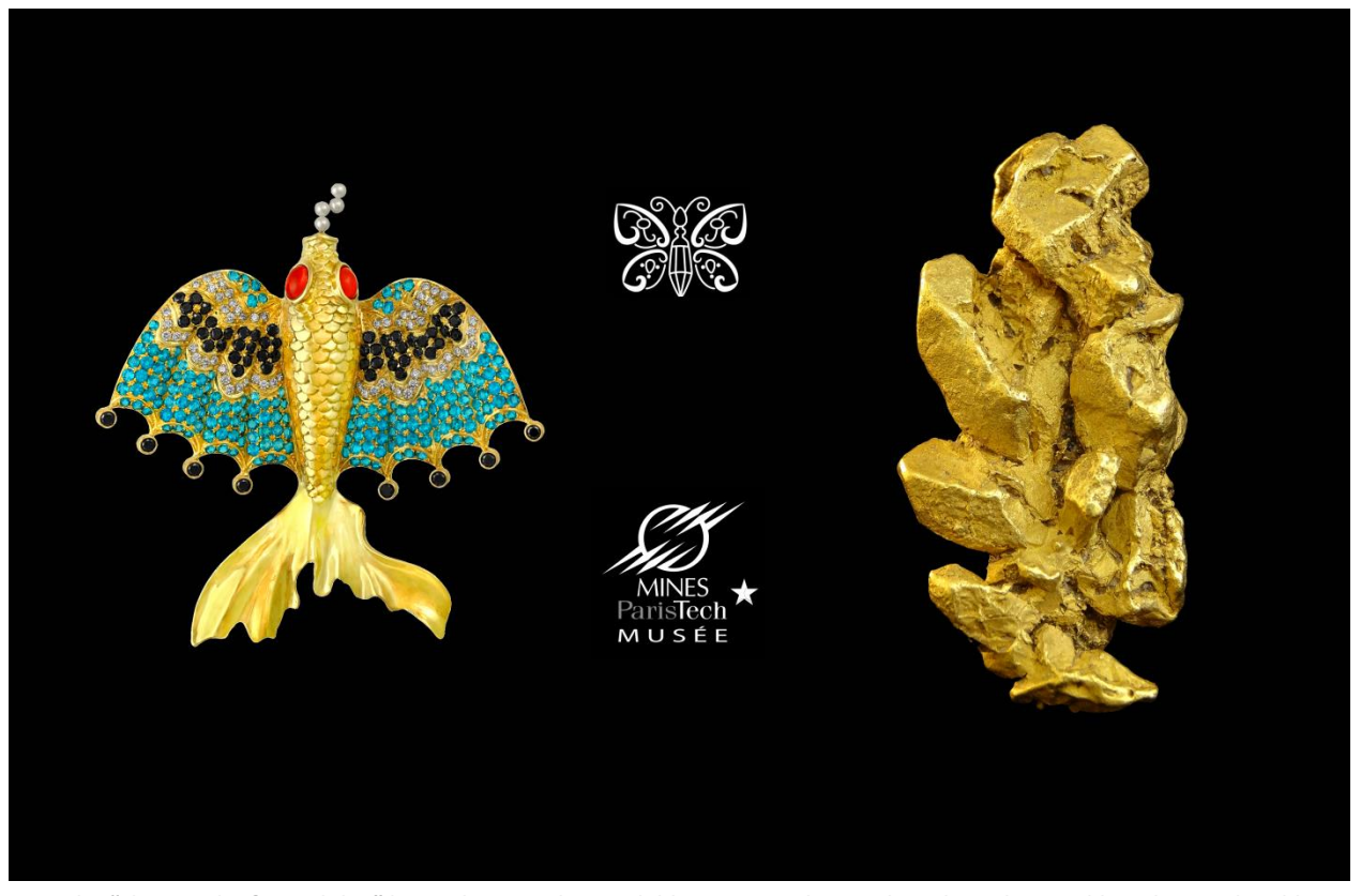
The "Flying Fish of Mandalay" by Paula Crevoshay with blue apatite, diamonds and pearls on gold, and a rough gold specimen from Australia in the collection of the Mineralogy Museum.

Gold is a malleable metal very rarely used in jewelry in its pure form. This is why it is generally associated with other metals (copper, silver, palladium, platinum or nickel) to form a more resistant alloy. The percentage of gold used in the alloy is measured in karats (not to be confused with the carat for gems): 24 karats is pure gold, 18 karats is 75% gold, 12 karats is 50% gold, etc. (a karat is 1 / 24^{th} of the total mass of an alloy).