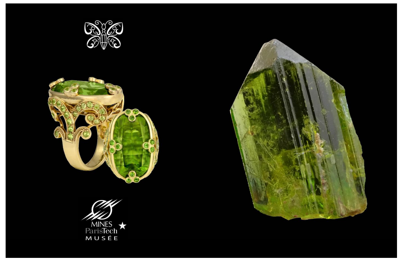
The « Cleopatra » ring by Paula Crevoshay made with peridot, and the exceptional peridot from St John's Island, Egypt, in the collection of the Mineralogy Museum.

Olivine is the most common mineral in the Earth's mantle. It can occur at the surface of the Earth in very specific tectonic settings, such as rifts (extension areas of the crust). The Egyptian rift, at the Red Sea, offers a historical and mythical deposit of peridot. It has been mined since the ancient Egypt, and still was until 1958. That is why it is found in Tutankhamun jewels and in many Christian religious artifacts from the Middle Ages, for example. Certainly one of the finest examples of a rough crystal coming from this place (St John's Island in the Red Sea) is presented in this exhibition, and is part of the collection of the Mineralogy Museum.