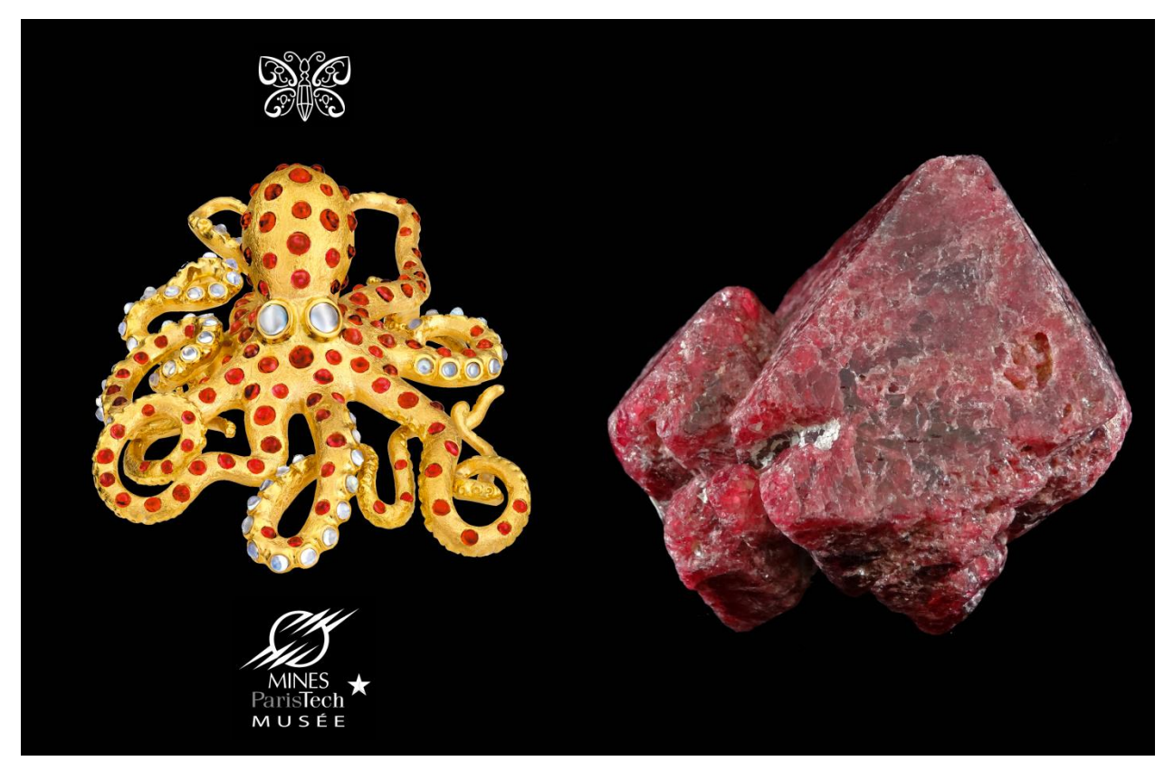
Red spinel and moonstone composing the "Octopus" by Paula Crevoshay, and a rough red spinel from Burma, in the collection of the Mineralogy Museum.

Spinel is an alternative for ruby. It can be found in many catalogs like those of the French or English Crown jewels. Today it is very popular again, not only for its red variety that has nothing to envy to ruby, but also for its other colors: blue, pink, purple. The cobalt-rich variety is certainly the rarest and most sought after by collectors, thanks to its electric blue color ("cobalt blue").